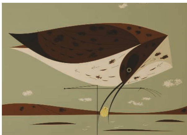
Minimal realism. Charley Harper reduced his subjects, such as Eskimo Curlew (serigraph, 1957), and their ecological context to elementary visual terms.